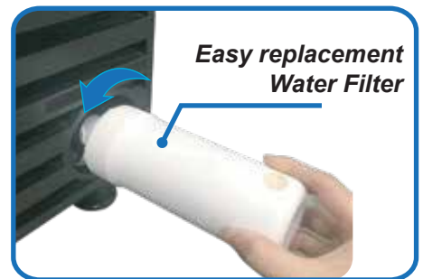
Easy replacement Water Filter

A filter is required for this machine to operate. If your machine stops producing ice, it is likely time to replace this filter. It is recommended that you replace the filter every 6 months, or more often depending on the quality of your water.