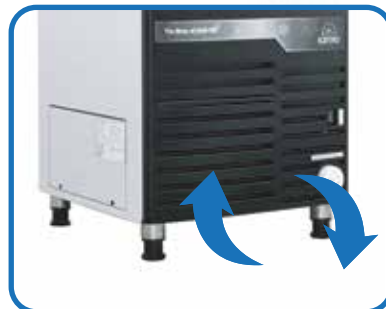
Built-in air ventilation (located in the front in/out) for optimal air flow to produce ice