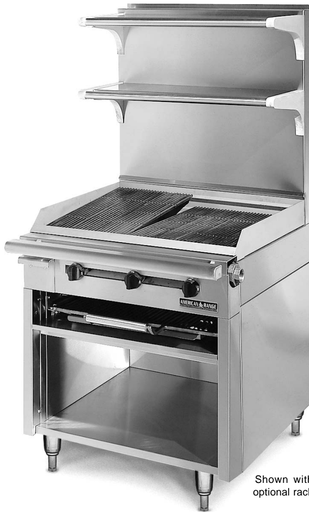
Shown with optional rack